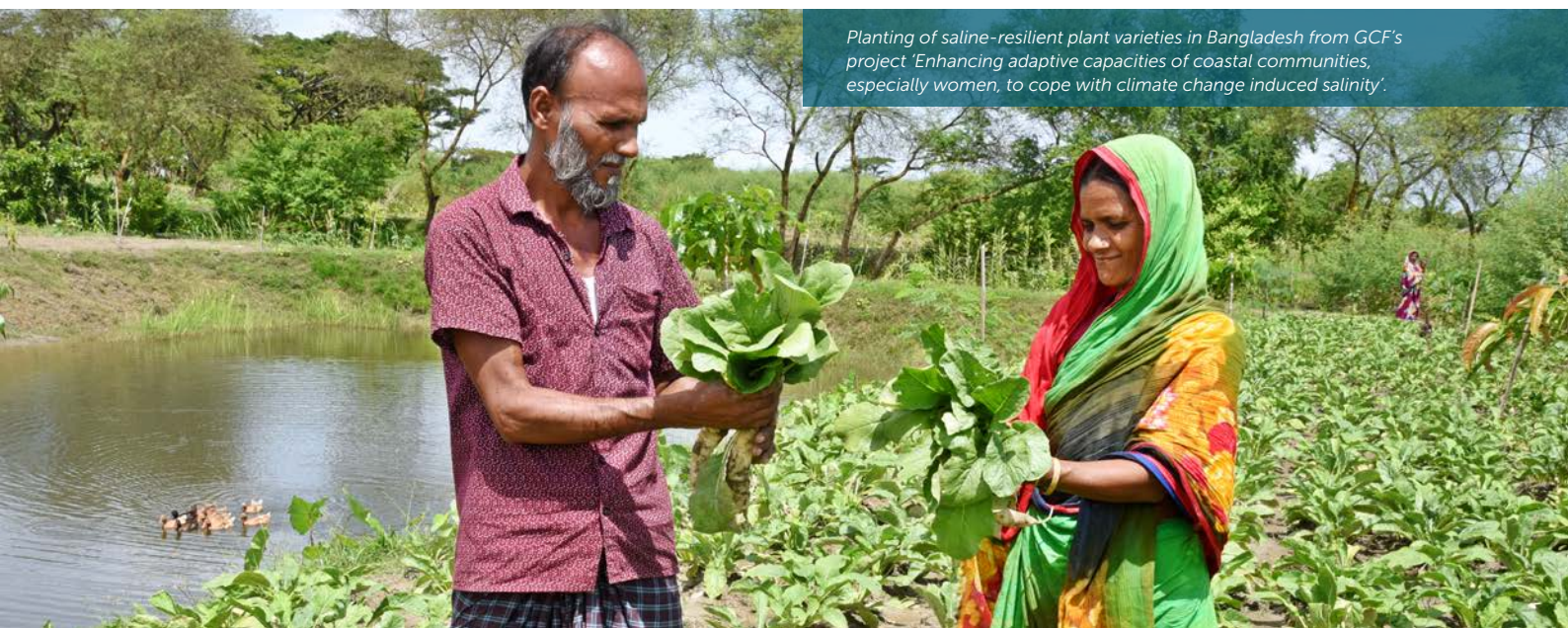
Planting of saline-resilient plant varieties in Bangladesh from GCF's project 'Enhancing adaptive capacities of coastal communities, especially women, to cope with climate change induced salinity'.