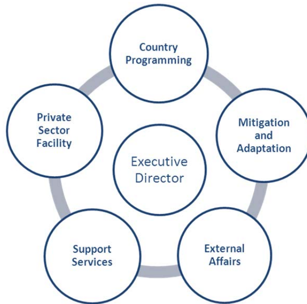
Figure 1. Initial structure of the Secretariat