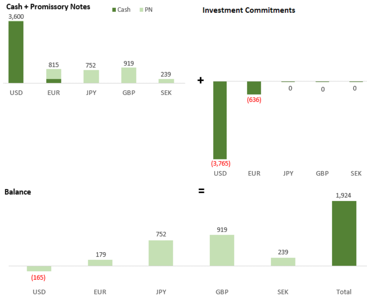
Figure 1: Cash and promissory notes available in the Trust Fund in different currencies and the funding commitments made by GCF until December 2018

Abbreviations: GBP = Great British pounds, JPY = Japanese yen, PN = promissory note, SEK = Swedish kroner.